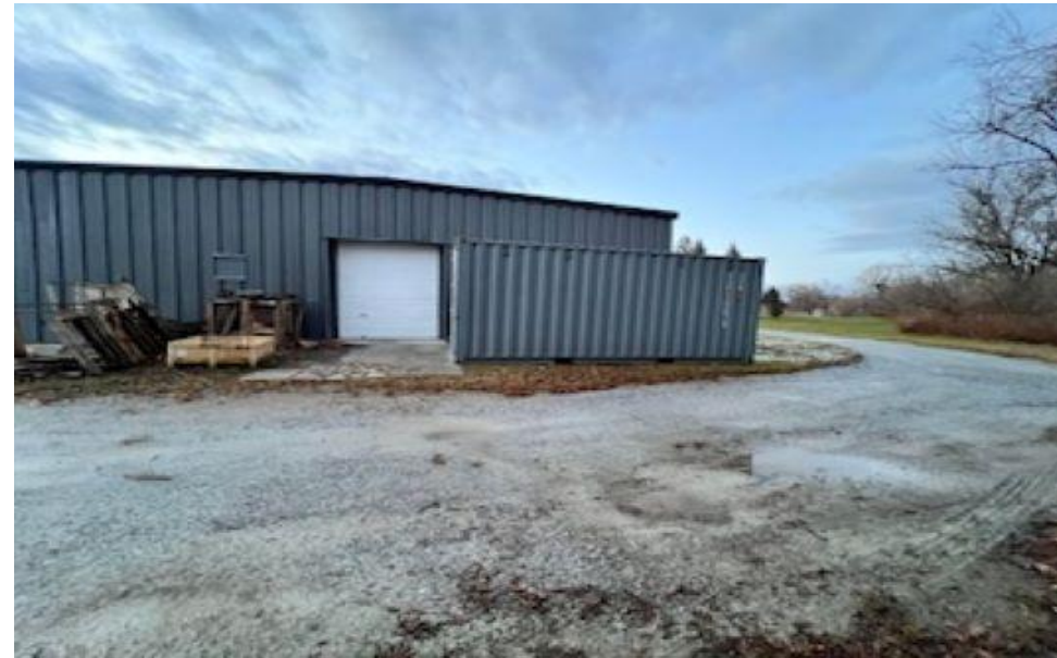
WAREHOUSE | 123 PARK STREET, RUTLAND, VERMONT